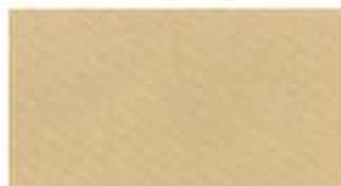
Tan Code 192