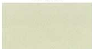
White Code 169