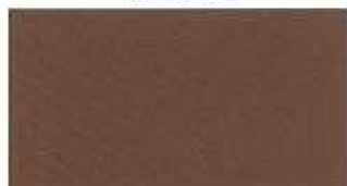
Cocoa Brown Code 172