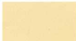
Ivory Code 180