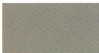
Light Gray Code 178