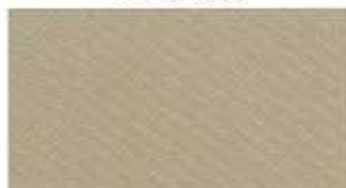
Hickory Moss Code 572