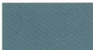
Caribbean Blue Code 584